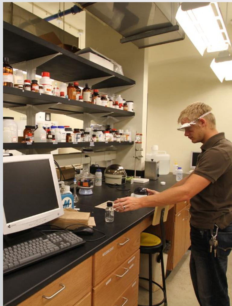
Temple Hall renovated lab