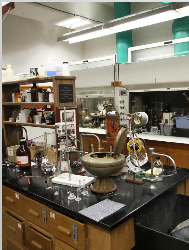
Temple Hall older lab