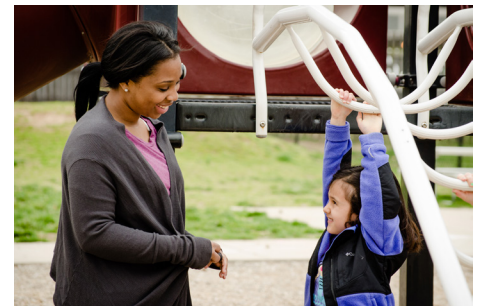
An MSU Student Teacher enjoying afternoon recess with a student

that help them to become ‘engaged in the community.’ These clubs and organizations directed by faculty in the College include the Student International Reading Association (SIRA), Student Council for Exceptional Children (SCEC), Student National Education Association (SNEA), Student Missouri State Teachers Association (SMSTA), and the Child Life Student Association (CLSA). These